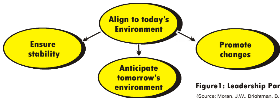
Figure 1: Leadership Paradox